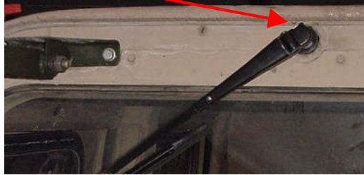
Picture of the complete exterior of the assembly

The pivot arm for the wiper assembly is located in the windshield, and connects the linkage from the motor to the wiper arm.