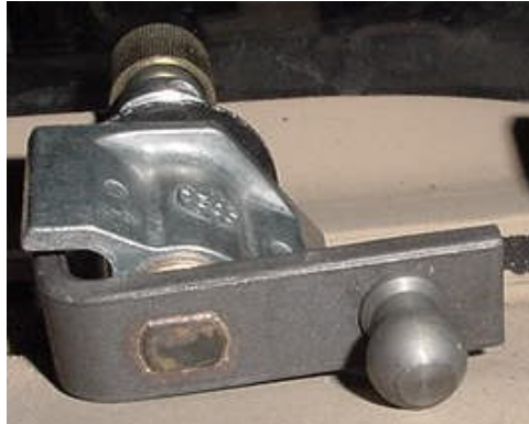
Picture illustrating the ball joint where the motor linkage attaches.

should fall back into the windshield frame. With aid of a screwdriver (or some prying device) pry the linkage socket joint off of the pivot arm ball joint. Remove the pivot arm assembly.