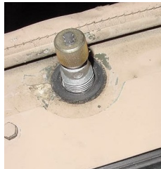
Picture of the Wiper Arm Pivot from the outside of the truck